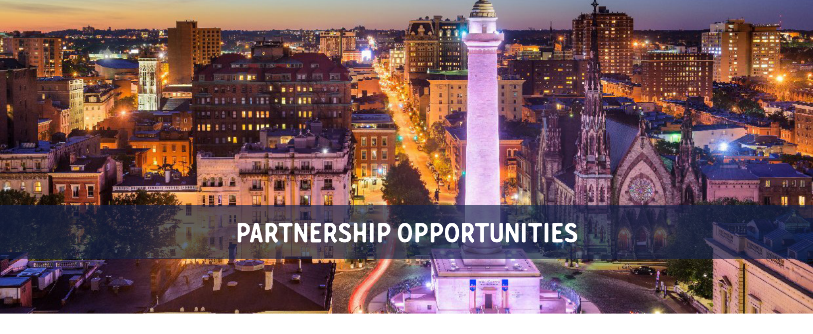
EXHIBIT SPACE RESERVATIONS

Companies wishing to exhibit must submit a completed exhibitor form with method of payment indicated on the form. Exhibits provide an enhanced experience to participants and provide useful information about developments, products and services related to their interests and responsibilities. Products or services displayed must further the purpose of the meeting and provide an atmosphere conducive to exchanging information relevant to the clinical content of the conference.