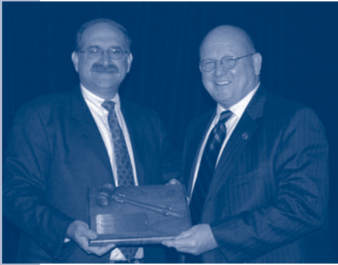
PHOTO HIGHLIGHTS OF THE 2006 ANNUAL MEETING October 12-15, 2006 / Washington, DC